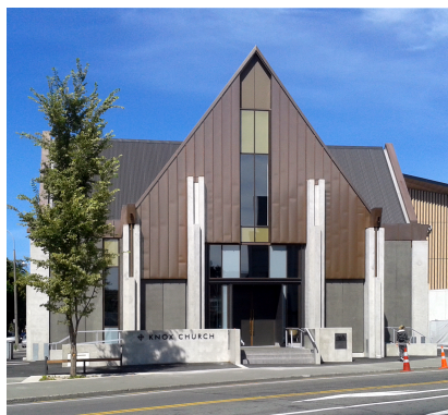
KNOX CHURCH love faith outreach community justice